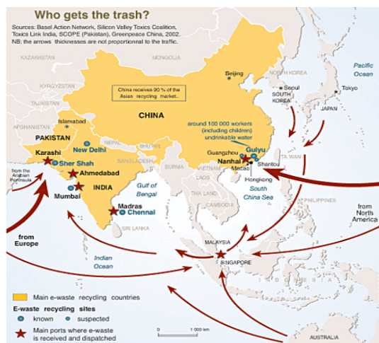
Fig.1 Map of dumping places in the world

IPC270 strongly says —Malignant act likely to spread infection of disease dangerous to life:- Whoever Malignant does any act which is, and which he knows or has reason to believe to be, likely to spread the infection of any disease dangerous to life, shall be punished with imprisonment of either description for a term which may extend to two year, or with fine, or with both.