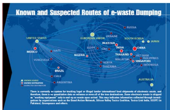
Fig.3. E-waste dumping in the world

IPC-487: Making a false mark upon any receptacle containing goods. [14] Whoever makes any false mark upon any case. Package or other receptacle containing goods, in a manner reasonably calculated to cause any public servant or any other person to believe that such receptacle contains goods which it does not contain or that it does not contain goods which it does contain, or that the goods contained in such receptacle are of a nature or quality different from the real nature or quality thereof shall, unless he proves that he acted without intent to defraud, be punished with imprisonment of either description for a term which may extend to three years, or with fine, or with both.