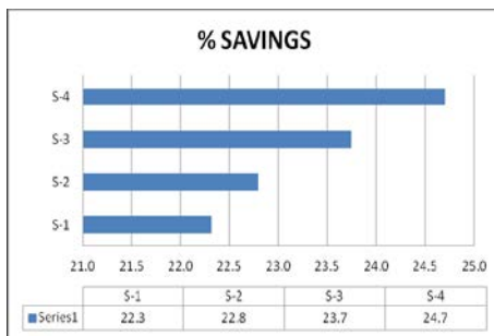
Fig. 1 % Savings

Note: CT = Concrete type, C = Cement, F.A = Fine Aggregate, C.A = Coarse Aggregate, U.F.S = used Foundry Sand