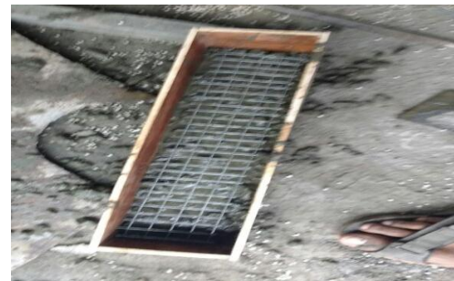
Fig. 1 Casting

In the casting process, all the ingredients were first mixed in dry condition, to the dry mix; calculated quantity of water was added and thoroughly mixed to get a uniform mix. Shuttering oil was applied on the inner face of plywood mould and the reinforcement cage was compacted by tamping rod as shown in Figure 3 calculated quantity of water was added and thoroughly mixed to get a uniform mix.