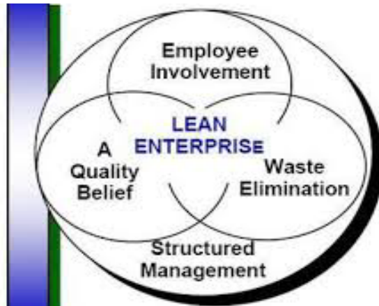
Fig.4 Wastes in internal operations

Most purchases are made based on what was purchased in the past, these 'repeat' purchases in terms of their source, costs and environmental impact.