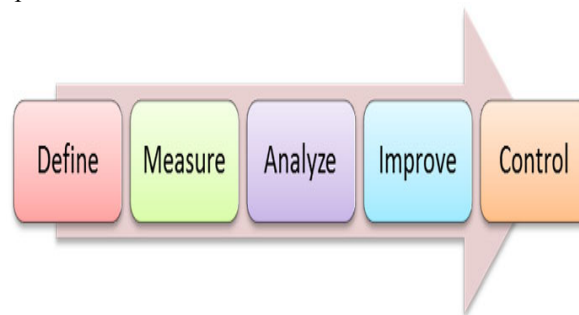
Fig. 1 Lean waste management