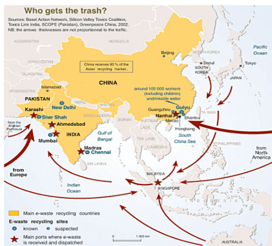
Fig.1 Map of dumping places in the world

IPC270 strongly says —Malignant act likely to spread infection of disease dangerous to life:- Whoever Malignant does any act which is, and which he knows or has reason to believe to be, likely to spread the infection of any disease dangerous to life, shall be punished with imprisonment of either description for a term which may extend to two year, or with fine, or with both.