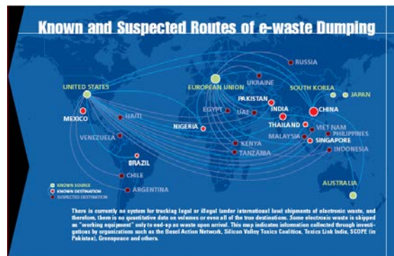
Fig.3. E-waste dumping in the world

IPC-487: Making a false mark upon any receptacle containing goods. [14] Whoever makes any false mark upon any case. Package or other receptacle containing goods, in a manner reasonably calculated to cause any public servant or any other person to believe that such receptacle contains goods which it does not contain or that it does not contain goods which it does contain, or that the goods contained in such receptacle are of a nature or quality different from the real nature or quality thereof shall, unless he proves that he acted without intent to defraud, be punished with imprisonment of either description for a term which may extend to three years, or with fine, or with both.