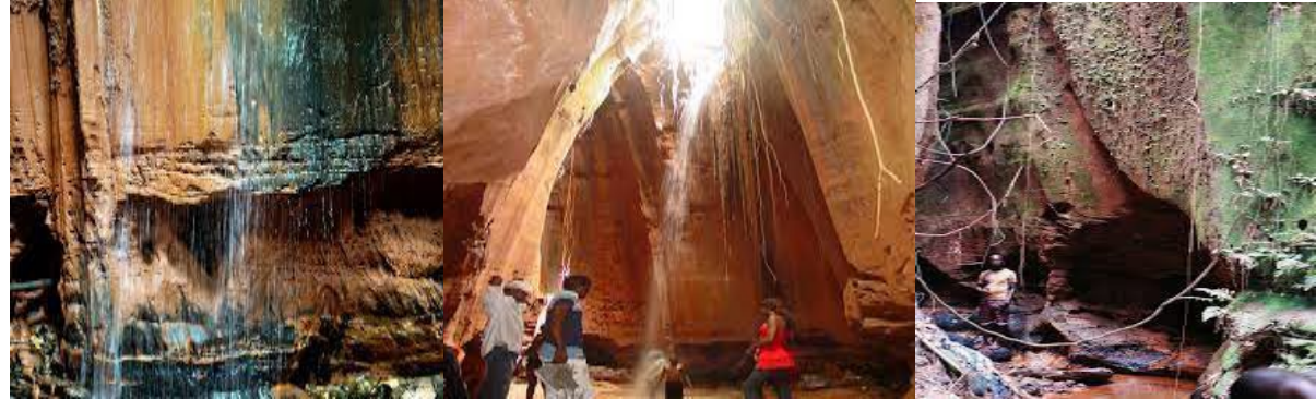
Fig. 4Ngwo Pine Forest Pictures

destination [4]. For the Igbo people in Nigeria, it's also important to them. A number of important cultural sites, including shrines and burial grounds, are located in the cave. Ngwo Cave and Waterfalls are threatened by a number of threats, ranging from deforestation to pollution or tourism.