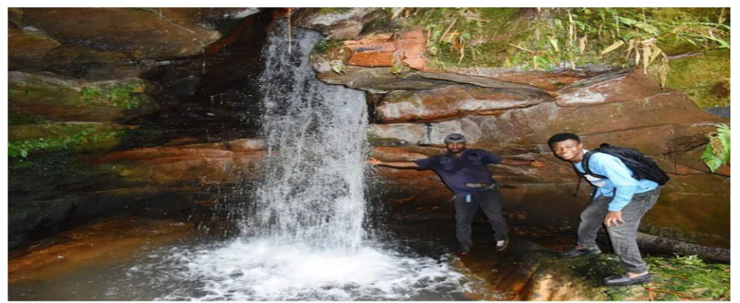
Fig. 12 Pictures of Ngwu Natural Spring Water

Government Area is something you won't forget in a hurry. From the narrow pathway to the flight of stairs and forest thickness, the water body has everything to wow you. The water is crystal clear and flows to the Urashi river which originates from Dikenafai, Imo State.