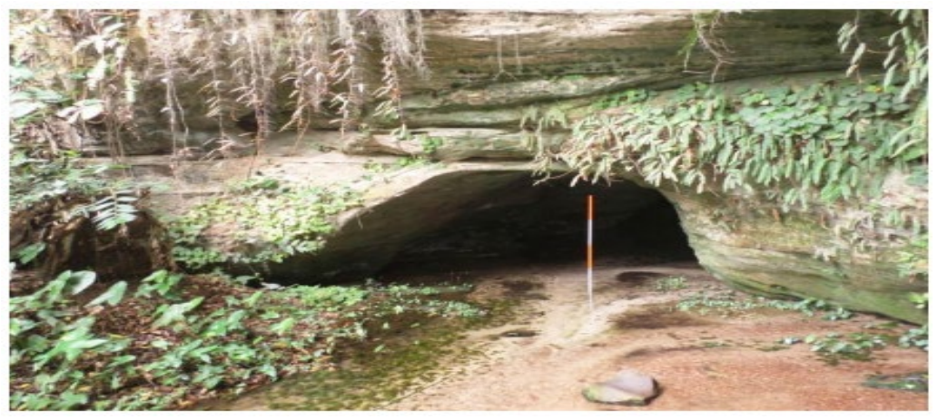
Fig.8 The Entrance of the Agu-Owuru Cave

confirmed. The people of the Ihuezi clan don't know where this cave came from; however, one date was given by the Enugu State Tourism Board that dates back to about 3,000 years. No scientific evidence has been established by historical, archaeological or anthropological investigations to support that date. There's a god named "Oba" living in the cave as well. This is where adherents of the religion are conducting their religious activities. Most of the celebrations were also held at this shrine in ancient times. The new yam festival, family celebrations and other community events are also part of this celebration. In addition, the god plays a role of purification, consultation and appeasement; sacrifices are carried out for all sorts of reasons at the temple. There's a deity near the cave. The deity serves as a demarcation of those who are frees from the laws and taboos of the cave.