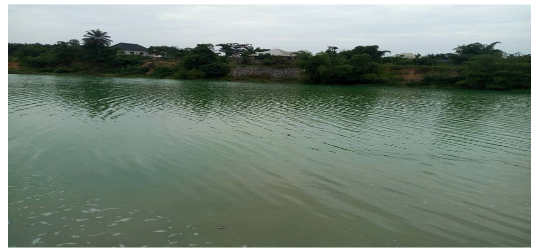
Fig. 6 Picture of Azumini blue river

its crystal-clear blue water that flows through a series of underground caves. Visitors can swim in the river, relax in the nearby resorts, and explore the surrounding caves and waterfalls [5].