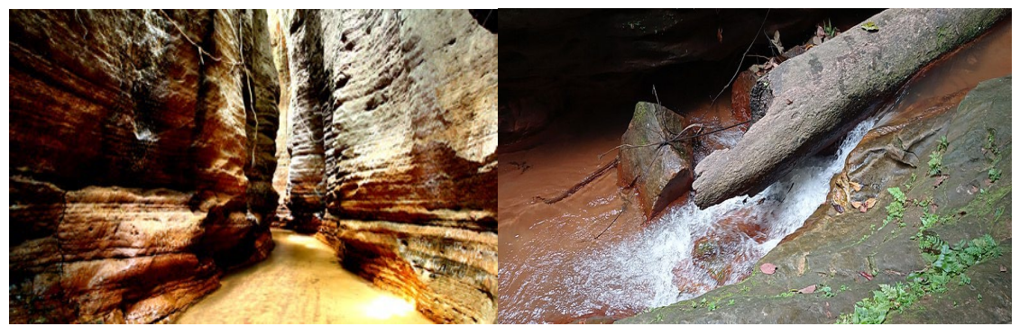
Fig. 2 Pictures of Awhum Waterfall

The Awhum waterfall in Nigeria is a popular tourist attraction for those who enjoy the outdoors and outdoor activities [2]. It is open to visitors to explore, stroll among the tumbling waterfalls, and take a dip in the glistening waters.