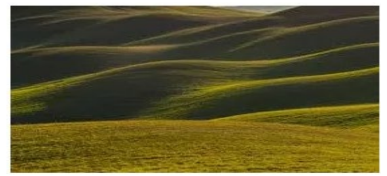
Fig. 11 Picture of rolling hills in Okigwe.

11. Ngwu Natural Spring Water: Ngwu spring water, also referred to as Iyi Umugara, is mysterious natural spring water in Ngwu. This natural water is mysterious because it flows without ceasing and the water's volume increases during the dry season, unlike other natural water bodies [7 and 11]. A trip to this natural spring in Nkwere Local