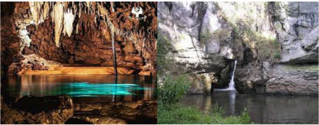
Fig. 7 Pictures of Ogbunike Cave

7. Agu-Owuru Cave: Some Nigerians who would have to travel through various land and cultures might be attracted by the geographical location of the study area as well as its atmosphere. Such natural areas, if they are encouraged, could open up the national horizon and inspire a deep appreciation of our nature and cultural diversity as well as pride in belonging to an area so vast and diverse.