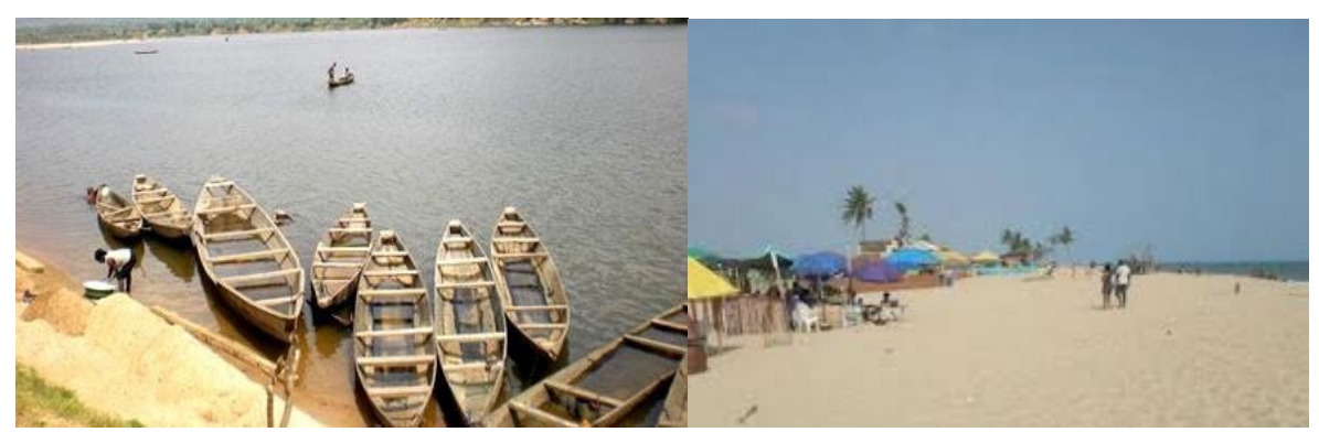
Fig. 13 Pictures of Ndibe Beach in Ebonyi State

13. Ndibe Sand Beach: Ndibe Sand Beach is at Afikpo North Local Government Area, Ebonyi State, Nigeria. Fishing and canoeing are among the main attractions of Ndibe Sand Beach. Visitors can revel at this beach with tons of fun activities to leverage for more relaxation [10].