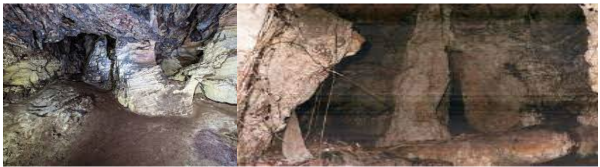
Fig 10 (a) Arochukwu long shrine cave Fig. 10 (b) Tunnels of Disappearance; these served as an underground slave route

tunnels around the hill of rags. There's a tunnel of disappearance, which is the dark tunnels where people went missing. At the site can be found the red river where it is said that as the victims disappear, the aro would colour the river red to give people the impression that the condemned has died. And the red water flowing down the stream would be a sign to the relatives that the victims were dead. Another feature is the IyiEke, an outlet from where the victims are now blindfolded to "Onu Asu Bekee", the European beach, which later became a government beach, and from there, waiting boats took the slaves to Calabar for onward transport to Ala Bekee. A number of major slave ports, such as Calabar, Bonny, Brass, Opobo and Lagos, have been developed along the Nigerian coast. These slaving ports were linked by well-defined routes to the slave markets and capital cities of the interior such as Oke-Odan, Oyo and Kano to the West and North West and old Calabar. To the East and North East, Arochukwu and Borno. Only Arochukwu was a divine intermediary among all those slave ports. Moreover, Caves expect Arochukwu is not associated with other slave ports in Nigeria. The Shimoni Caves in Kenya can be compared to this site [7 and 9].