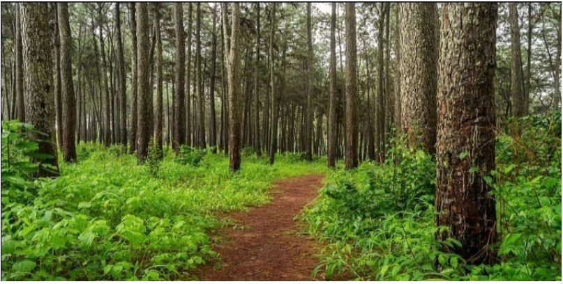
Fig. 3 Picture of Ngwo Pine Forest

Forest is used as a play field, most frequently as a picnic area. For Enugu State, Nigeria, this is a means of developing the economy [7]. The Ngwo Pine Forest Formation [NPFF] is a patch of montane rainforest and cloud forest on the Ngwo Hills in southeast Nigeria. It is the southernmost part of the Afromontane forest ecoregion, which makes it one of Africa's more diverse forests.